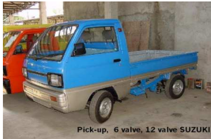
Pick-up, 6 valve, 12 valve SUZUKI

think that's not so bad for us to have that kind of setting. The difficult situation we are facing right now is having a car that we don't know could anytime break down while driving for it always over heats and we feel so tired of this because it hinders our schedules. Plus our road is going thru a pineapple field. So that means off-road challenge.